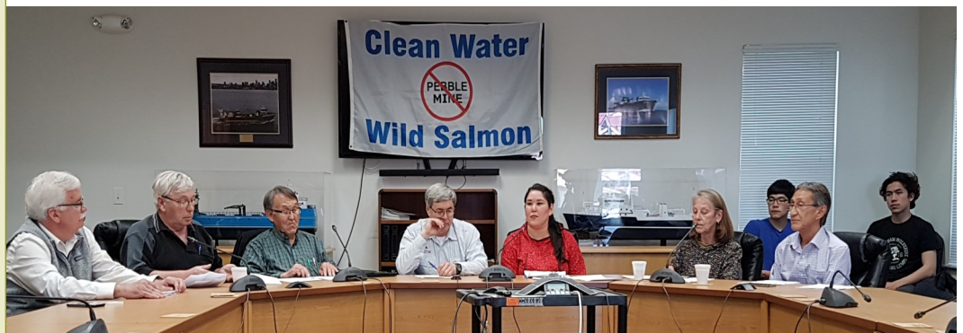
Bristol Bay Leadership at a press conference in Dillingham, AK on Pebble and EPA settlement.

Following the rally, nine officials from the region participated in a press conference in Dillingham,