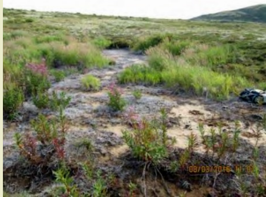
Dead vegetation and acidic drill cuttings (light-colored material in foreground) remain years after the hole was drilled. Soil was over 100 times higher in copper and molybdenum than background. The nearest hole (DDH 6355) was drilled in 2006.

The United Tribes of Bristol Bay praises the new requirements, and we are encouraged that more robust monitoring and accountability are now the standard in this new permit. “We are thankful that the Department of Natural Resources took a hard look at what was happening at the Pebble site, rather than simply rubber stamping these permits as was done in the past,” said Robert Heyano, president of UTBB, in a written statement. UTBB will continue to monitor the cleanup efforts at the Pebble site throughout the summer work season.